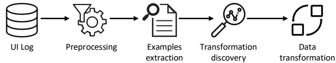
Figure 2: Baseline approach for discovering data transformations in UI logs.

recorded, it is preprocessed. Then, a collection of transformation examples is extracted from the preprocessed log, followed by the discovery of data transformations. This baseline approach is described in Sections 4.1 and 4.2. We then present two optimizations of the baseline approach. The first optimization aims at reducing the number of fields in the transformation examples (Section 4.3) while the second optimization (Section 4.4) reduces the number of transformation examples given as input to the discovery step.